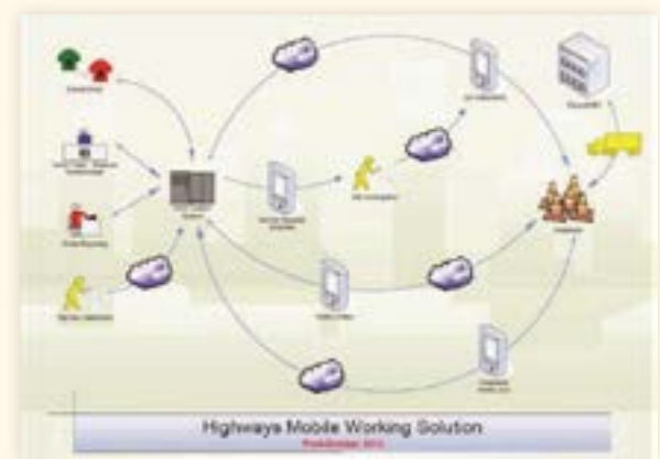
Figure 2: Using Confirm, Confirm Connect and Confirm Workzone, Dorset Council has streamlined asset management processes. Now mobile devices instantly upload information, saving considerable time that staff used to spend completing, transporting and managing paper-based records.

Infrastructure and Technology Manager, Dorset Council